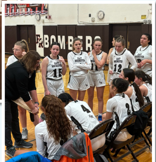
Varsity Girls Basketball Team