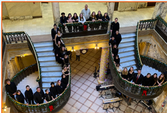
ERHS Select Choir and Jazz Band