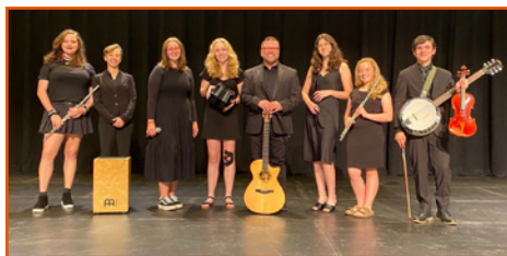
ER's Irish music ensemble Róisín Dubh