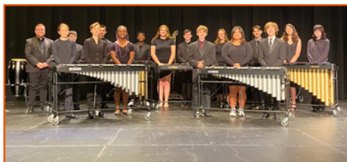
ERHS Percussion Ensemble