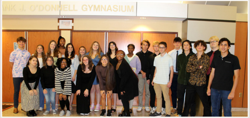
The East Rochester National Honor Society's new and existing members